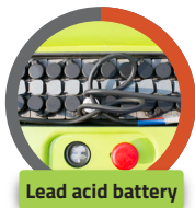
Lead acid battery